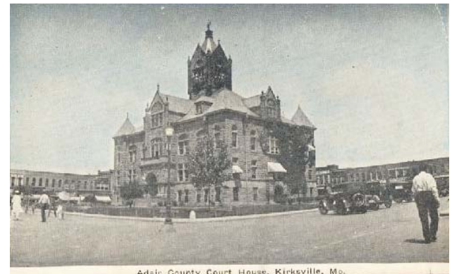
Adair County Court House, Kirksville, Mo.

The third and present Adair County courthouse dates from the turn of the century.