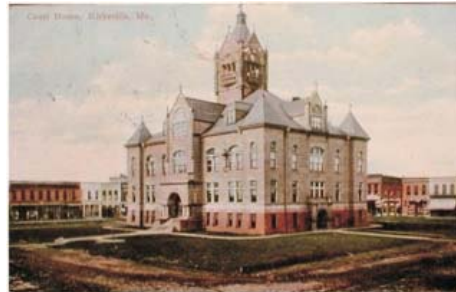
Adair Historical Markers

The original slate roof was replaced with a shingle roof.